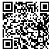
University Proctors and Delegates