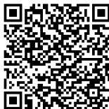
University Sustainable Development Committee